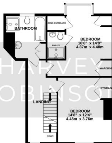
1ST FLOOR 582 sq.ft. (54.1 sq.m.) approx.