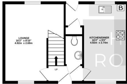
GROUND FLOOR 404 sq.ft. (37.6 sq.m.) approx.