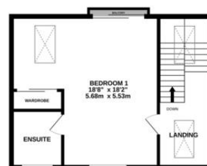
2ND FLOOR 463 sq.ft. (42.8 sq.m.) approx.