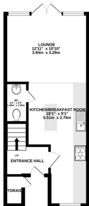
GROUND FLOOR 367 sq.ft. (34.1 sq.m.) approx.